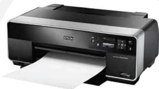
Purchase an Epson Stylus Photo R3000 Printer

and receive one (1) Signature Worthy® Sample Pack (S045234) (Value $24.95) by mail.