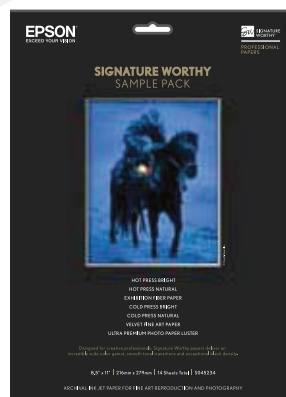
GET ONE (1) Epson Signature Worthy Sample Pack (S045234) (up to $24.95 value) by mail

CLAIMS MUST BE POSTMARKED WITHIN 30 DAYS FROM DATE OF PURCHASE. PRODUCT MUST BE PURCHASED BETWEEN OCTOBER 1, 2011 AND NOVEMBER 30, 2011. PLEASE ALLOW UP TO 10 WEEKS FOR PROGRAM FULFILLMENT.